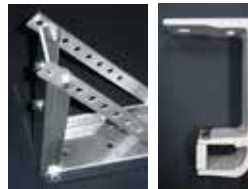
ROOF MOUNT SOFFIT MOUNT

The Eclipse features a non corrosive torsion bar that is powder coated to match the framework of the awning.